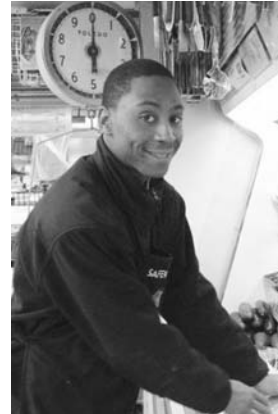
Safeway staff going above and beyond