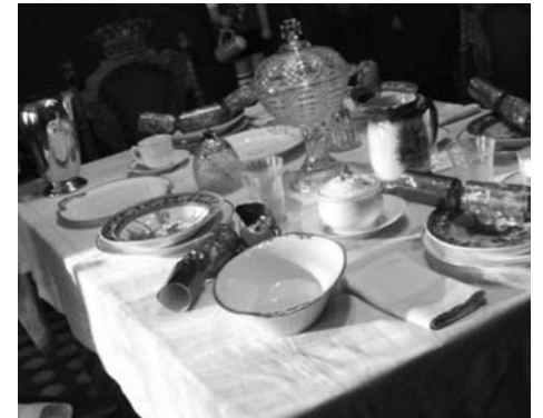
(Above) The family breakfast table