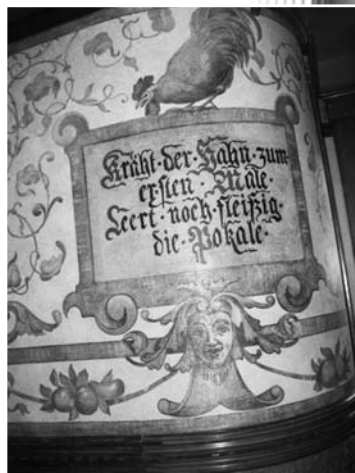
The rooster motto found in Heurich's Bierstube reads, "When the cock crows for the first time empty your drinking cups while you can." Better known as 'last call'.