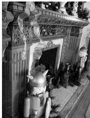
(Above) The ornate, formal sitting room fireplace