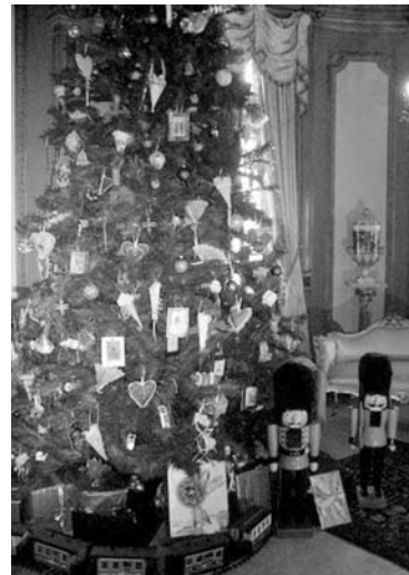
A typical tree complete with nutcracker in the Heurich Family Formal Room.