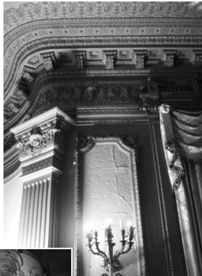
(Right) Ceiling & wall detail from the formal sitting room